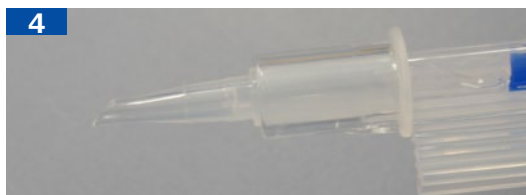
Advance the plunger until it begins to move the IOL forward and ensure that it is moving freely.