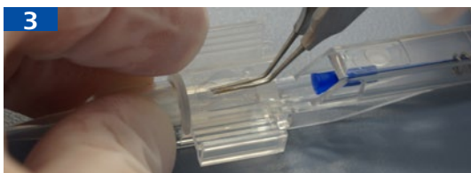
Maintain the IOL in place with the folding forceps while closing the cartridge. Take care that the haptics do not slip out from the cartridge grooves between the wings.