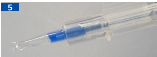
To control the release of the IOL from the tip, slow down the movement of the plunger when the optic portion of the lens reaches the beveled end of the tip.